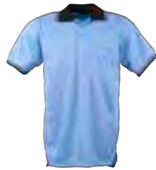
BASEBALL/SOFTBALL SHORT SLEEVE W/ COLLAR $54.99

Choose from any cut of our 3N2 OFFICIATING SHIRTS encompassing all major sports including: Baseball, Basketball, Football, and Wrestling.