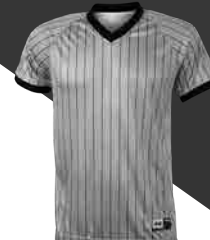
WRESTLING/BASKETBALL/SOCCER SHORT SLEEVE V-NECK $49.99