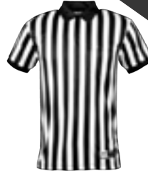
FOOTBALL/SOCCER SHORT SLEEVE W/ COLLAR $54.99