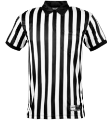
FOOTBALL/SOCCER SHORT SLEEVE W/ COLLAR $54.99