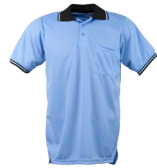
BASEBALL/SOFTBALL SHORT SLEEVE W/ COLLAR $54.99

MOST POPULAR CUTS PICTURED TO THE RIGHT. ALL SPORTS AVAILABLE. CONTACT IF YOU NEED MORE OPTIONS.