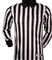
LONGSLEEVE AVAILABLE $64.99