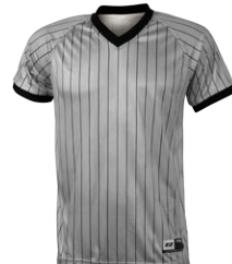
WRESTLING/BASKETBALL/SOCCER SHORT SLEEVE V-NECK $49.99