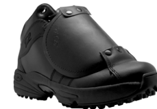
BLACK (WIDTH EE) 7355-0101E

With its wear-resistant, highly polishable, 100% genuine leather construction, the REACTION PRO PLATE MID is a great call for the officiating professional with an eye on comfort and protection – the legendary comfort of a 3N2 turf shoe and the protection of a rugged, impact-absorbing, thermo-molded toe. At only 18.7 ounces per shoe, it may be the lightest plated umpire shoe in the game. Its trademark midsole has been specifically designed to reduce the knee and joint stress associated with game-after-game action. Features the black on black color scheme umpires prefer and is designed to minimize dirt build-up for easy cleaning.