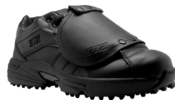
BLACK (WIDTH EE) 7345-0101E

With its wear-resistant, highly polishable, 100% genuine leather construction, the REACTION PRO PLATE LO is a great call for the officiating professional with an eye on comfort and protection – the legendary comfort of a 3N2 turf shoe and the protection of a rugged, impact-absorbing, thermo-molded toe. At only 15.7 ounces per shoe, it may be the lightest plated umpire shoe in the game. Its trademark midsole has been specifically designed to reduce the knee and joint stress associated with game-after-game action. Features the black on black color scheme umpires prefer and is designed to minimize dirt build-up for easy cleaning.