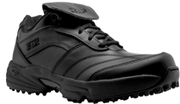
BLACK (WIDTH EE) 7335-0101E

With its wear-resistant, easily polished 100% genuine leather construction, the REACTION LO is a great call for the officiating professional with an eye on comfort and durability. Its lightweight, compression-molded EVA midsole has been specifically designed to reduce the knee and joint stress associated with prolonged standing. Fitted with a removable leather tongue flap.