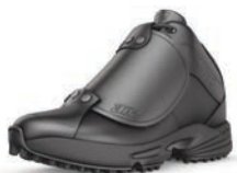
BLACK (WIDTH EE) 7355-0101E