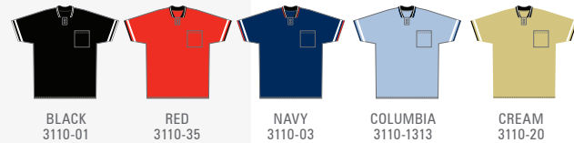
BLACK 3110-01 | RED 3110-35 | NAVY 3110-03 | COLUMBIA 3110-1313 | CREAM 3110-20