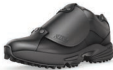
BLACK (WIDTH EE) 7345-0101E